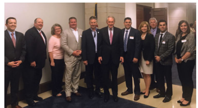
NECA Boston Chapter representatives with Massachusetts Senator Edward Markey.

The NECA contractors met with members of Massachusetts Congressional delegation to discuss local jobs, infrastructure investment, modernization of the multiemployer pension plan system, and other issues impacting the industry in the