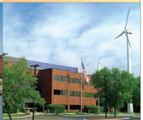
JATC Training Center/Wind Turbine, Boston, MA

In the world of construction, quality and safety are critical to every project. Which is why leading architects, general contractors, building owners, and facility managers throughout Eastern New England rely on the skilled union electricians of Local 103 of the International Brotherhood of Electrical Workers (IBEW) and the professional electrical contractors of the Greater Boston Chapter of the National