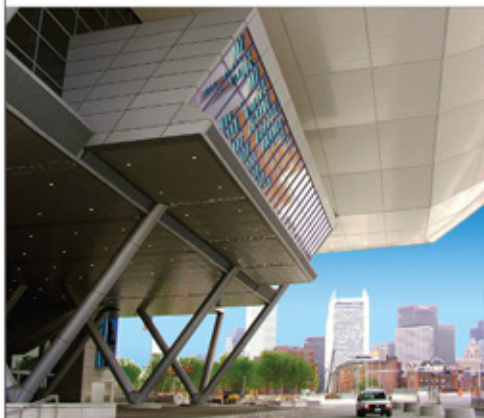
Boston Convention and Exhibition Center

NECA and IBEW set the standard for excellence in electrical, telecom, and renewable energy projects throughout Eastern New England.