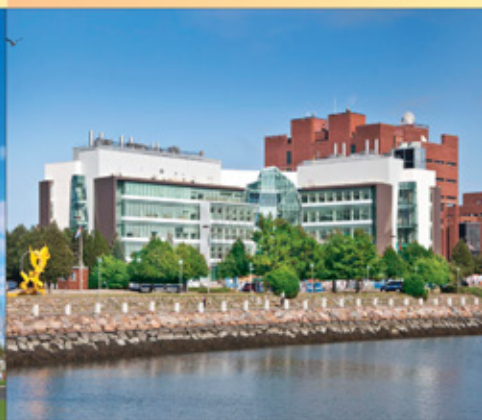
UMASS Boston Integrated Sciences Complex