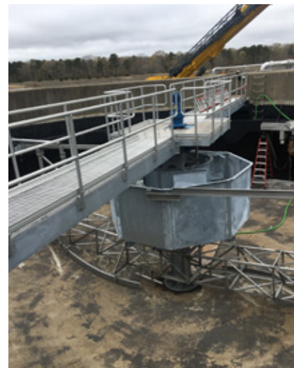
The water clarifier system project for the Town of Barnstable Water Pollution Control facility is underway.

optimal operations and capacities, Chapman Construction Group, Inc. (CCGI), a Sandwich, Massachusetts based WBE, DBE and Veteran-owned certified, NECA contractor, has expanded its focus in the wastewater purification market. Chapman has completed a number of projects