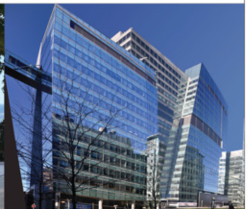
Center for Life Science, Boston, MA