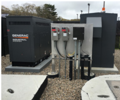
The Town of Barnstable pump station generator, power distribution and control house at Cape Cod Community College.

and president of Chapman Construction, spoke of the firm's expertise and current work in the water purification market. "The installation of pump stations and related water treatment facility systems requires hands-on knowledge and experience with electrical installations that power their operation as well as the integrated control systems. CCGI is pleased to have been called upon by the Towns of Barnstable and Norton to ensure their new and upgraded water purification facilities are installed and operate properly. Up-to-date, properly functioning wastewater treatment facilities are critical to all Bay State residents, to our waterways, and the environment." Chapman has been a member of NECA Boston for eight years, having joined the Chapter in 2009.