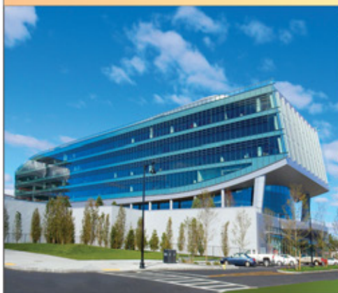
New Balance World Headquarters, Boston, MA